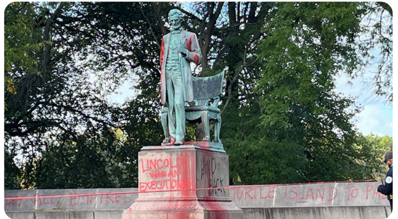
Saint-Gaudens, The Standing Lincoln, Lincoln Park, dedicated in 1887, vandalized 2022.

Fulfills Experiential Learning requirement!